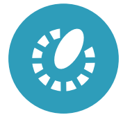
Multi operation modes