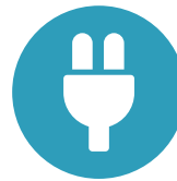
Low power consumption