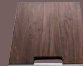
Wooden chopping board

Discover the full range at a specialist store or on our website