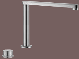
BLANCO ELOSCOPE-F II