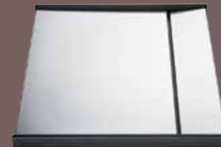
Applicable drip tray