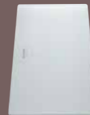
Glass chopping board