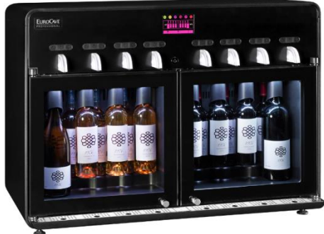
Non binding image