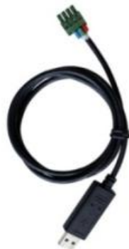
PC communication cable CC-USB-RS485-150U-3.81 (1.5m)