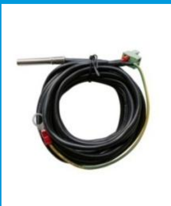
Remote temp. sensor RTS300R10K5.08A (3m)