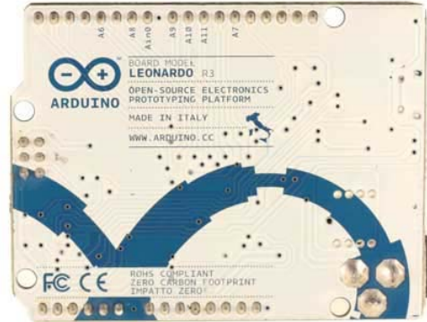
Arduino Leonardo Rear