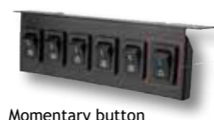
HC-CARGO 171762 Switchpanel for LED light-bar with basic 5 functions and momentary button for pattern switch