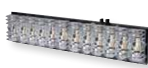
HC-CARGO LED corner flash 12 LED flash corner module 171858/171859 Xtreme, amber 171916 Xtreme, blue