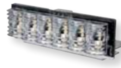
HC-CARGO LED flash 6 LED flash module 171856/171857 Xtreme, amber 171915 Xtreme, blue