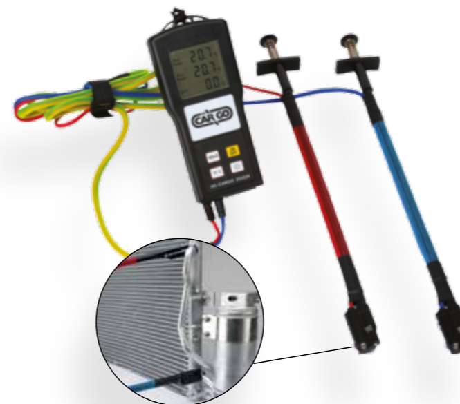
HC-CARGO Temperature Testing Tool

And we are continuously developing the program with attractive products to meet market trends and demands.