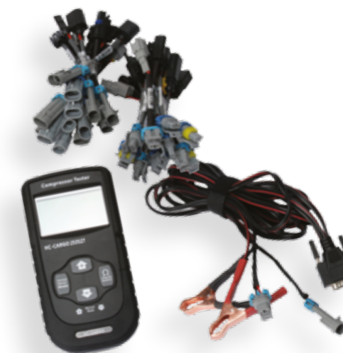
HC-CARGO Compressor Tester