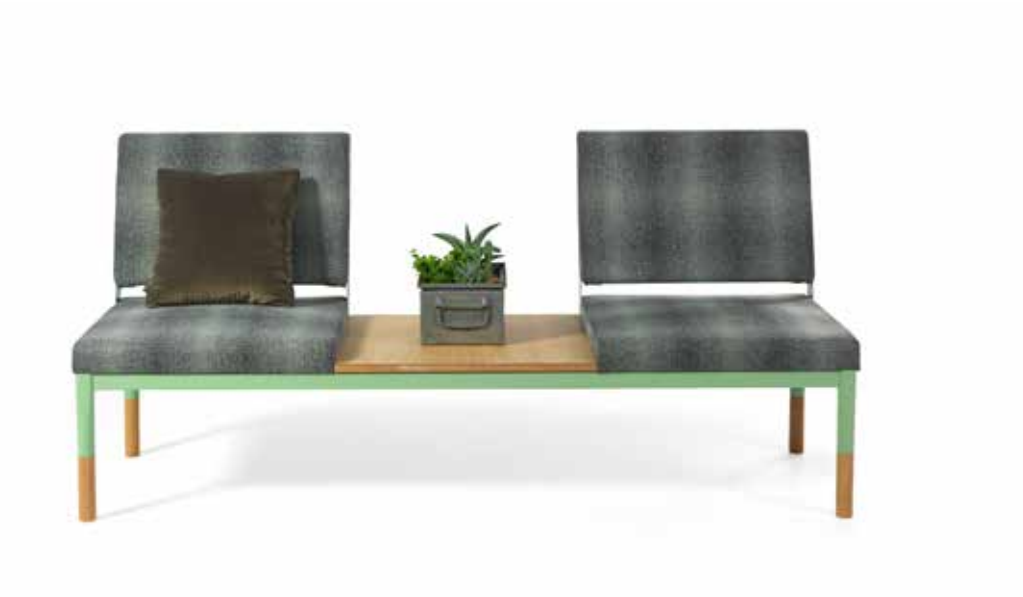
Modules 2-seater, low back, 60cm table Upholstery Camira Hebden HWC24 Colour Ral 6021 Wood Oak