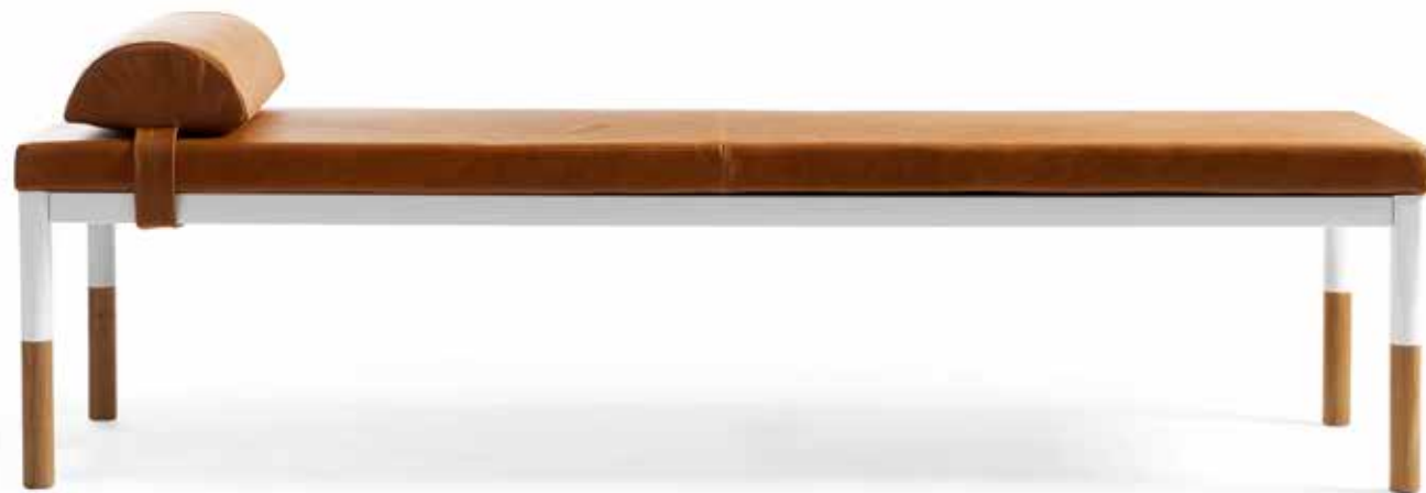
Modules Daybed Upholstery United Leather Vintage collection colour Cognac Colour White Wood Oak

Reform comprises some 30 items of furniture, all of which work equally well on their own or combined in different constellations. In some instances, needs are met with just a few furnishings. A simple seating group in a waiting room or lobby. A private corner for a few minutes' seclusion. Chairs and tables for informal meetings in the office or a pleasant shared space at work. The versatility of the series lies in the rich potential for variation and the opportunities to choose the colour of items to meet your needs and wishes.