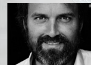
Reform design by Alexander Lervik

The Reform sofa responds to your needs today and can respond to your needs tomorrow!