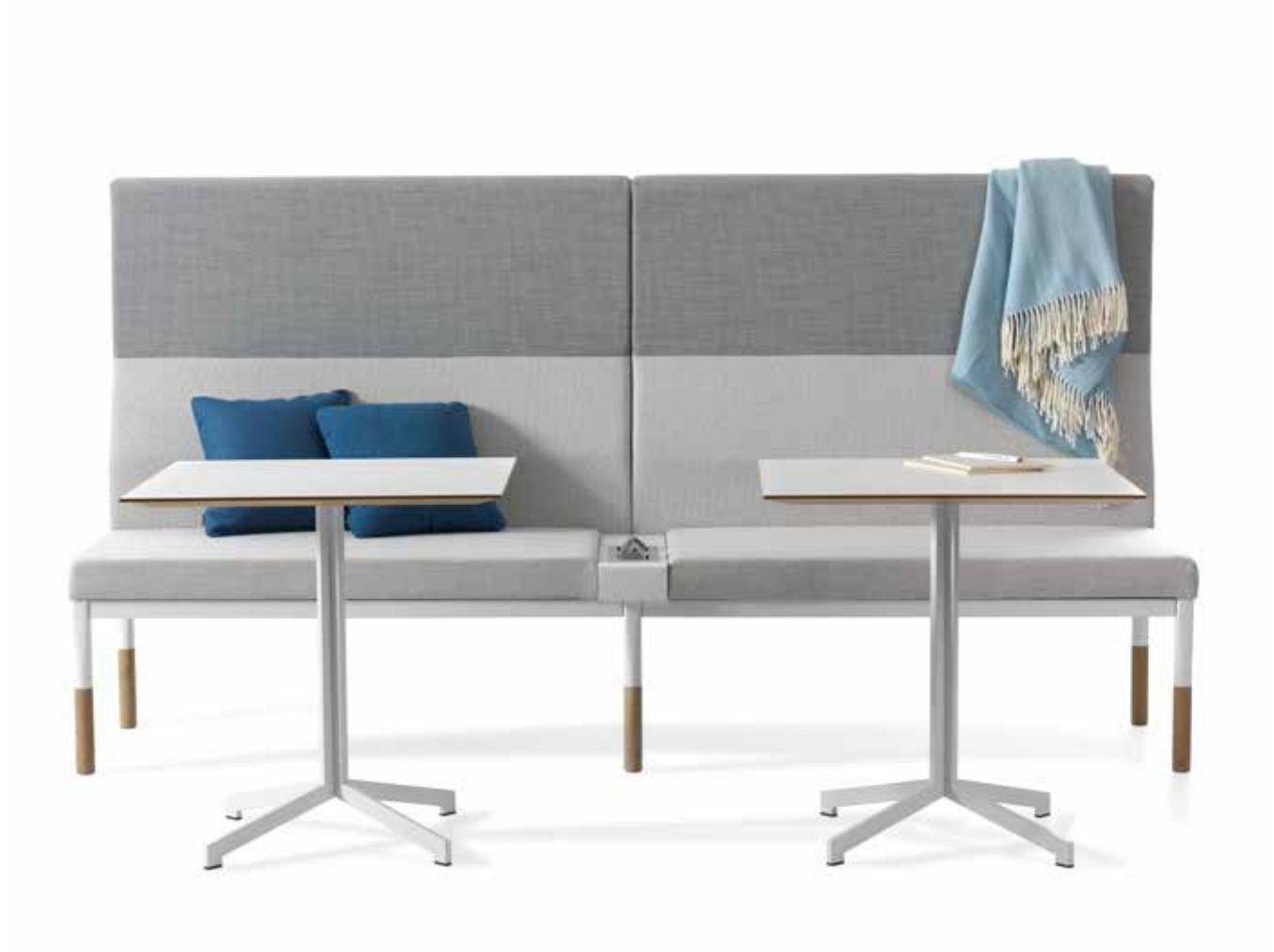
Modules 4-seater, middle high back, with electric equipment Upholstery Kvadrat, Seat and low back: Mode 009. Top: Canvas 124 Colour White Wood Oak