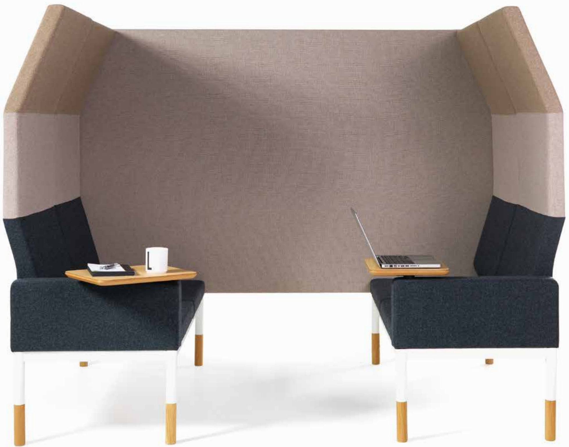
Modules 4-seater, high back, dividing wall 212cm, armrest with clipboard Upholstery Camira, Seat, low back and armrest: Hemp HWP06. Middle part and dividing wall: Hemp HWP02. Top: Hemp HWP05. Colour White Wood Oak