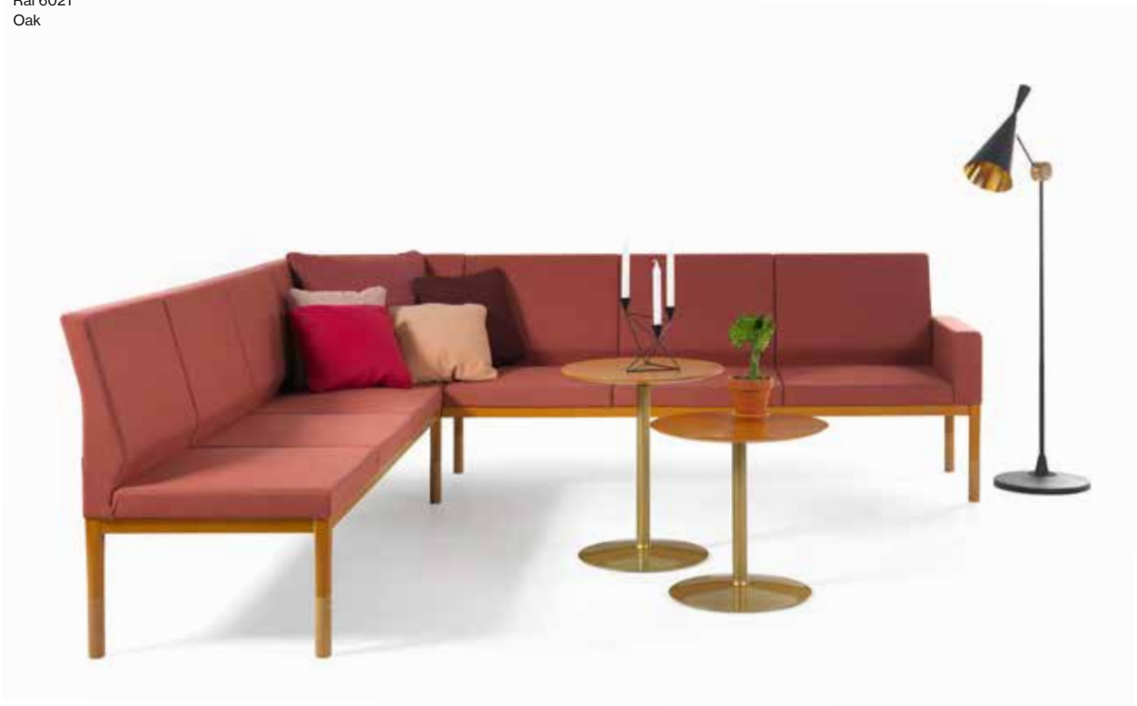
Modules 7-seater corner sofa, low back, with 1pce armrest 10cm. Upholstery Camira Blazer CUZ84 Colour: Ral 8001 Wood Oak