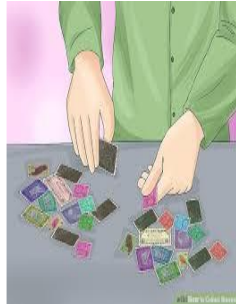
To collect stamps