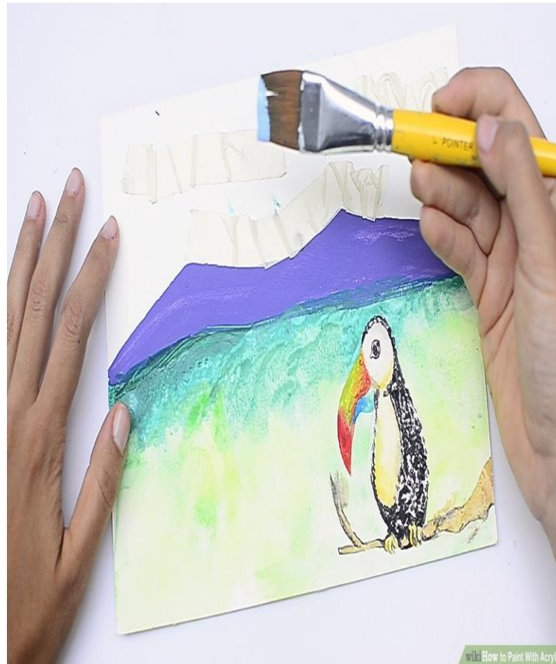
To paint | to draw