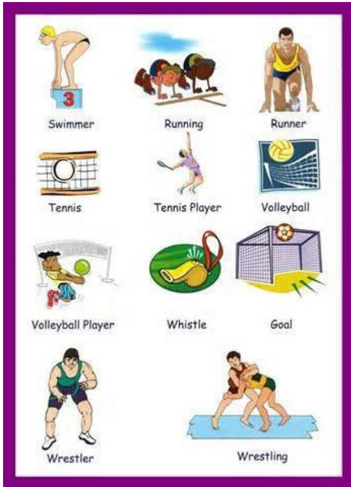
To go in for sports