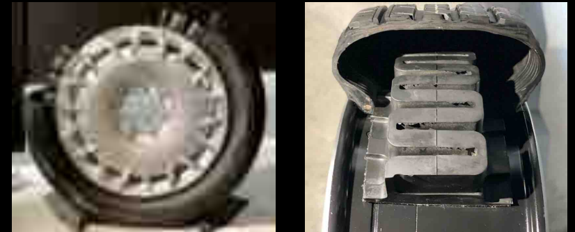
KAMA-133 tyre system with Run-flat