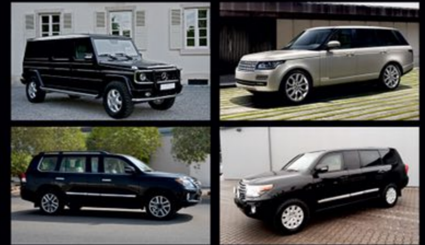
Stretched SUVs based on different make/models