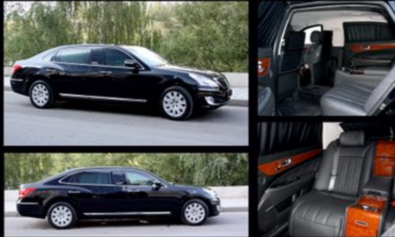
Stretched and armored limousine based on Hyundai Equus LV500 VR7/VR9 +300mm

All armored vehicles are protected in accordance with EU Directives VPAM BRV2009 and ERV2010