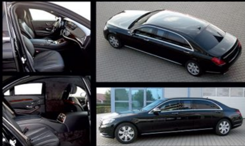
Stretched and armored limousine based on Mercedes-Benz S600 V222 Guard VR7/VR9 +500mm