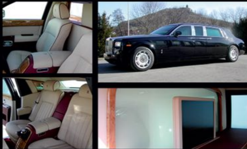
Stretched and armored limousine based on Rolls-Royce Phantom EWB VR7/VR9 +500mm