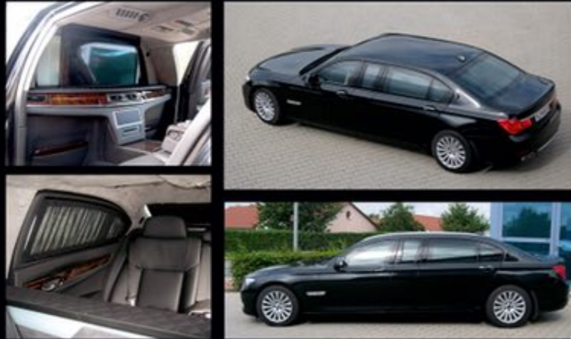
Stretched and armored limousine based on BMW 760Li F03 High Security VR7/VR9 +400mm

All armored vehicles are protected in accordance with EU Directives VPAM BRV2009 and ERV2010