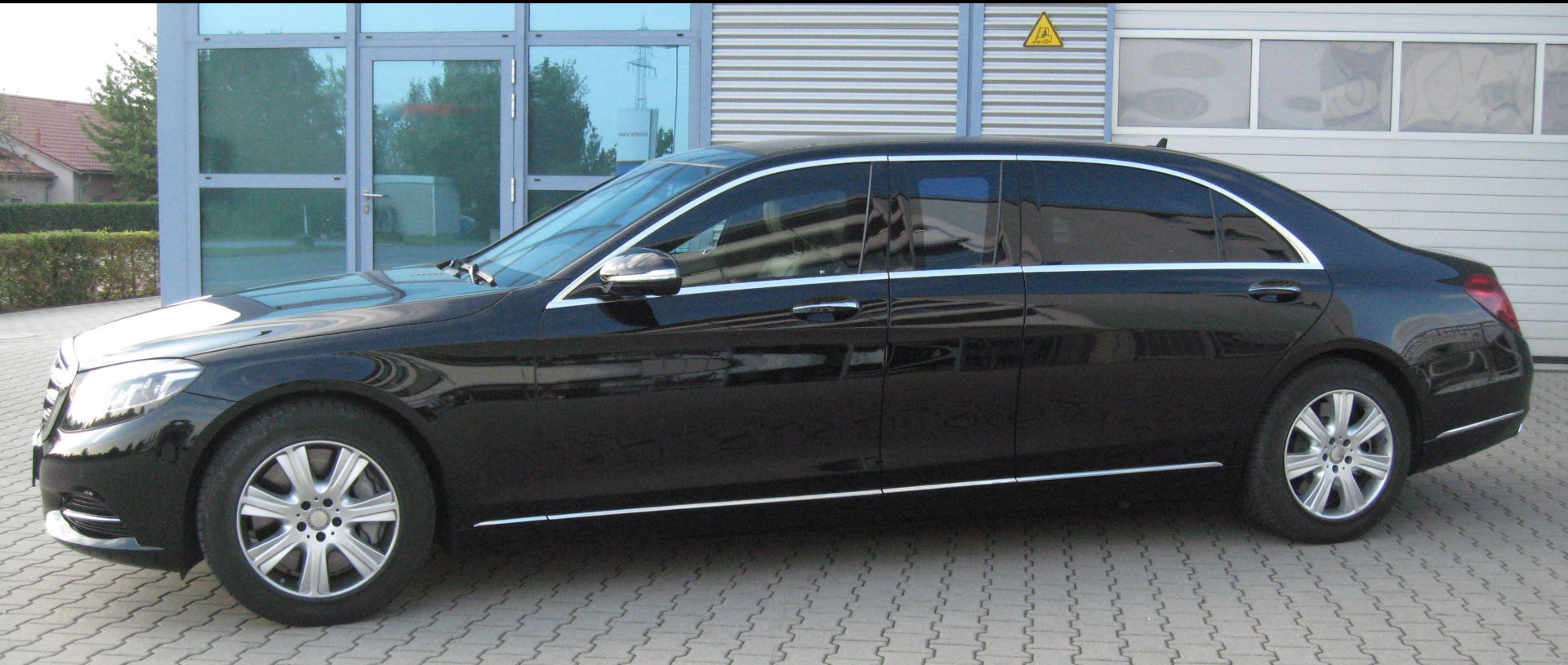
Mercedes-Benz S600 V222 Guard VR9 2015 YM +500mm

Permissible load on the front / rear axle - 2100 / 2570kg (2390 / 2810 Mercedes-Benz S600 V222 Guard VR9 )