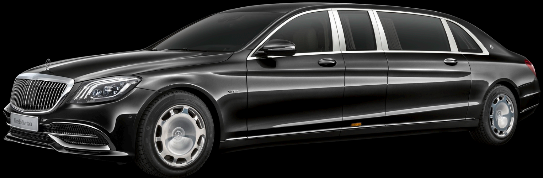
Mercedes-Maybach S650 Vv222 Pullman Guard VR9 2018 YM

Permissible load on the front / rear axle - no data