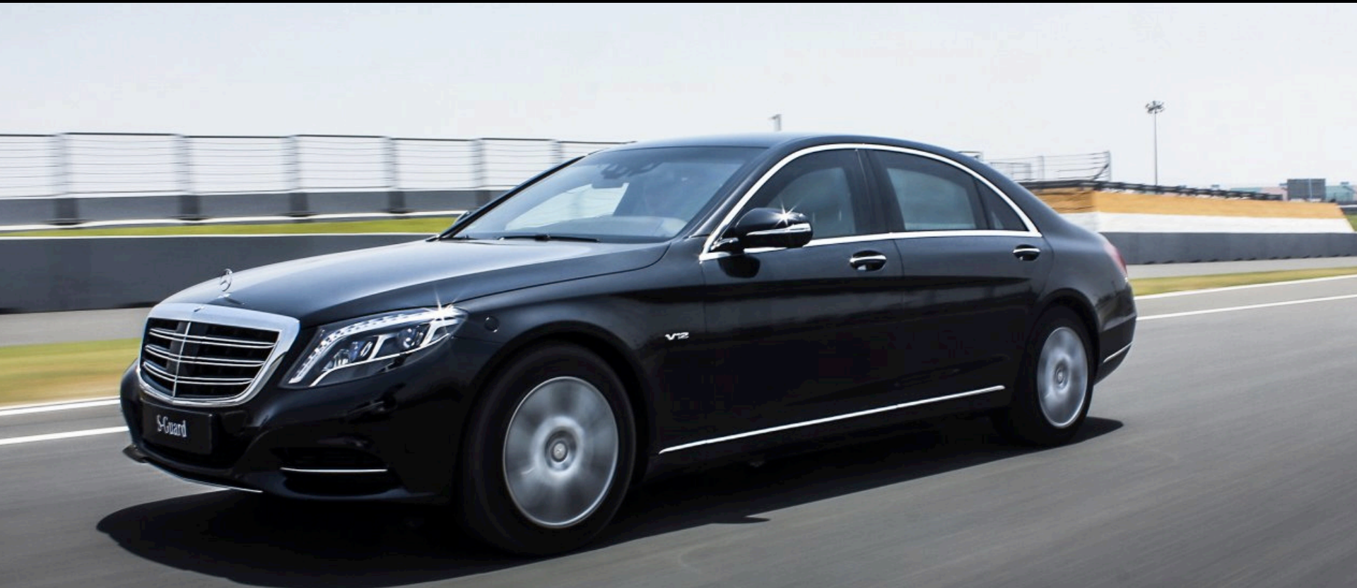
Mercedes-Benz S600 V222 Guard VR9 2015 YM

Permissible load on the front / rear axle - 2100/2570 kg