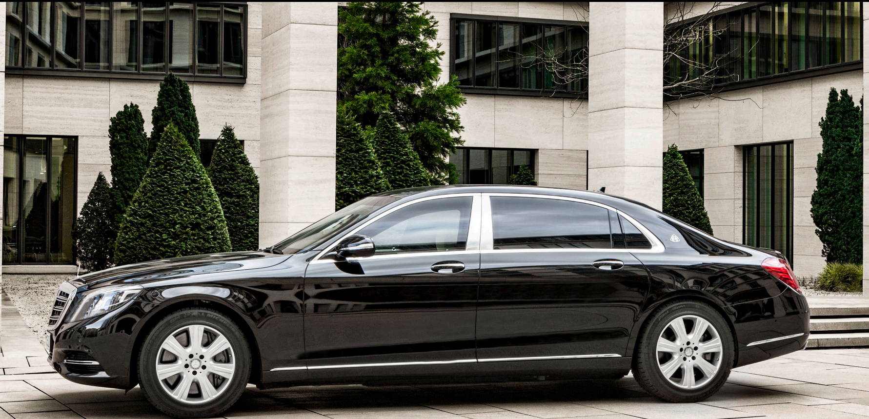
2Mercedes-Maybach S600 X222 Guard VR9,VR10 2016 YM

Permissible load on the front / rear axle is 2180/2720 kg kg (2100/2570kg Mercedes-Benz S600/650 V222 Guard VR9/VR10)