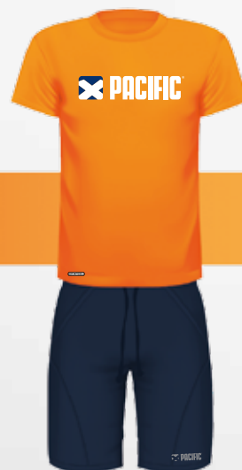
ORIGINAL T-SHIRT Orange