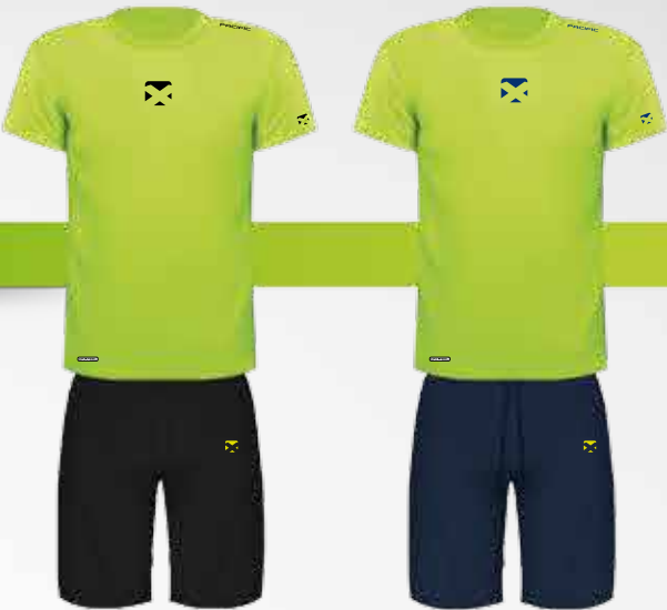
FUTURA SHORT Black / Navy