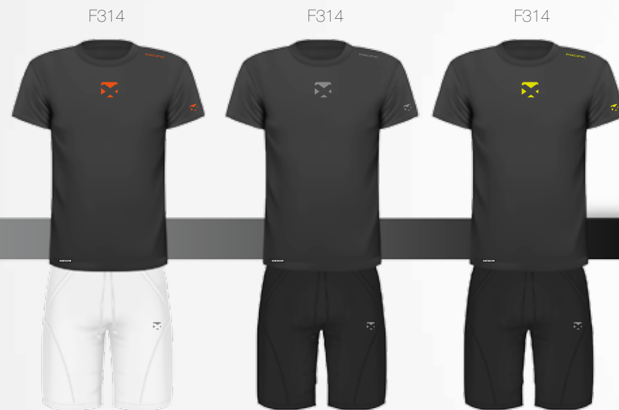
FUTURA SHIRT Black