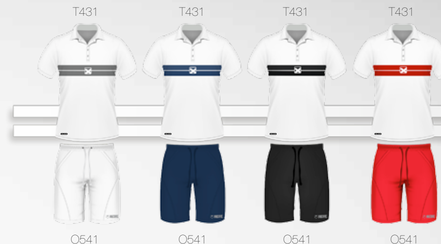
TEAM PRO SHORTS White/Navy/Black/Red