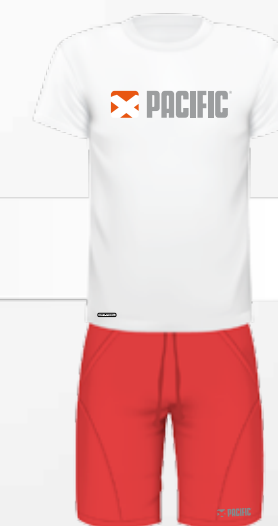
ORIGINAL T-SHIRT White