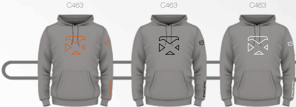
COURT HOODIE Black