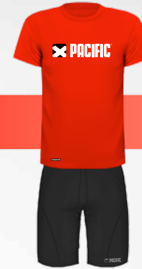
ORIGINAL T-SHIRT Red