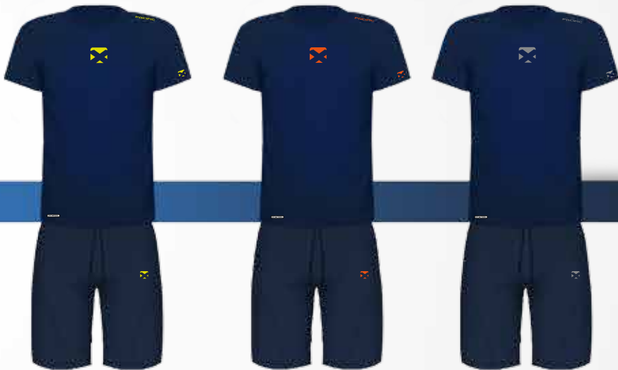
FUTURA SHIRT Navy