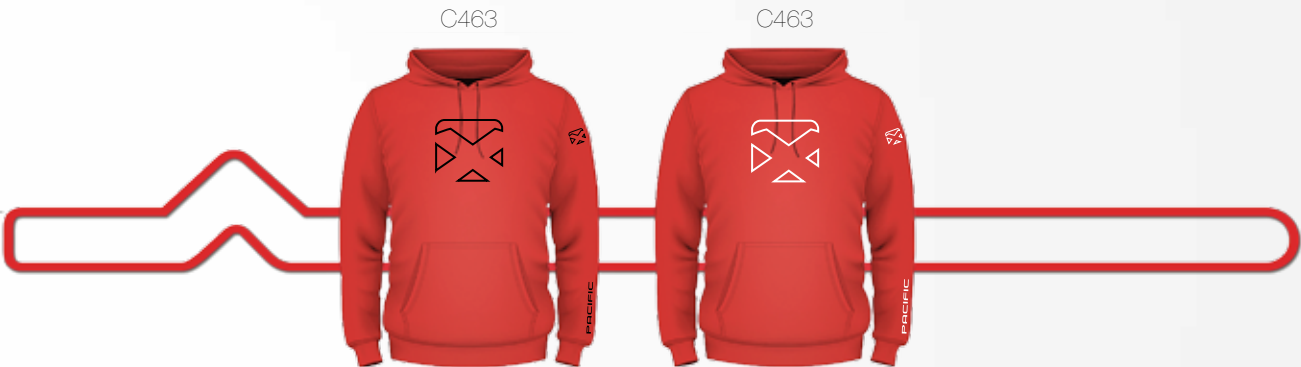
COURT HOODIE Red