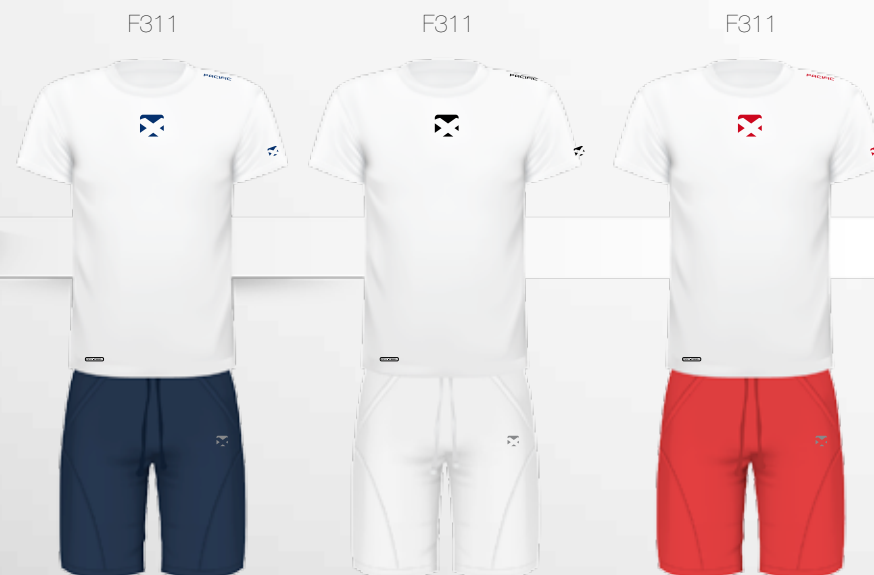
FUTURA SHIRT White