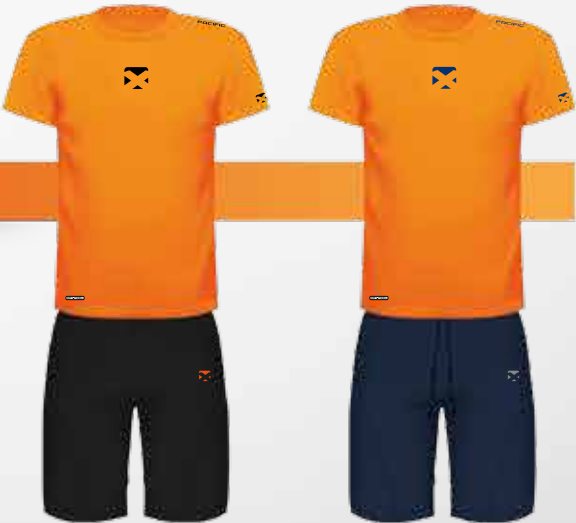
FUTURA SHORT Black / Navy