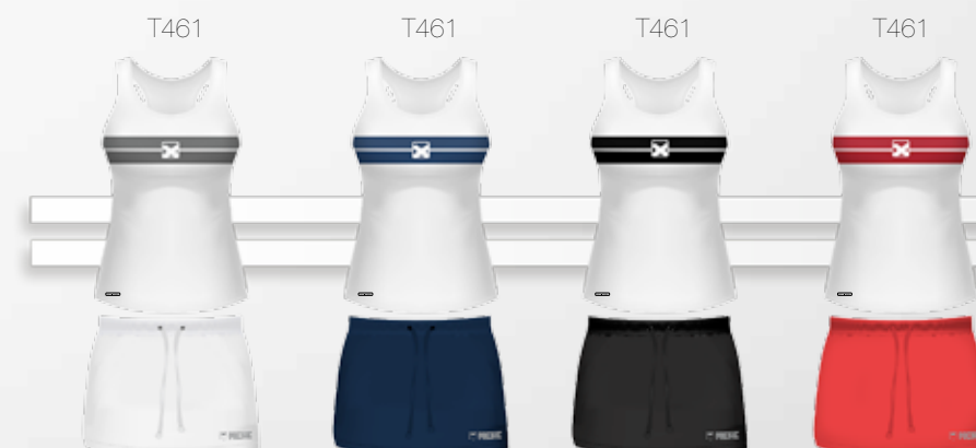
TEAM PRO TOP WOMEN Grey/Navy/Black/Red