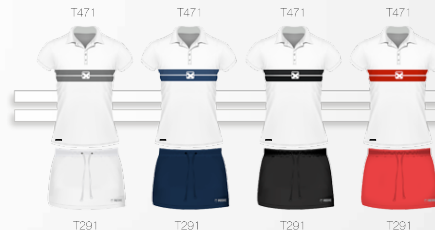
TEAM SKIRT White/Navy/Black/Red